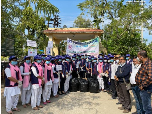
CLEAN INDIA CAMPAIGN