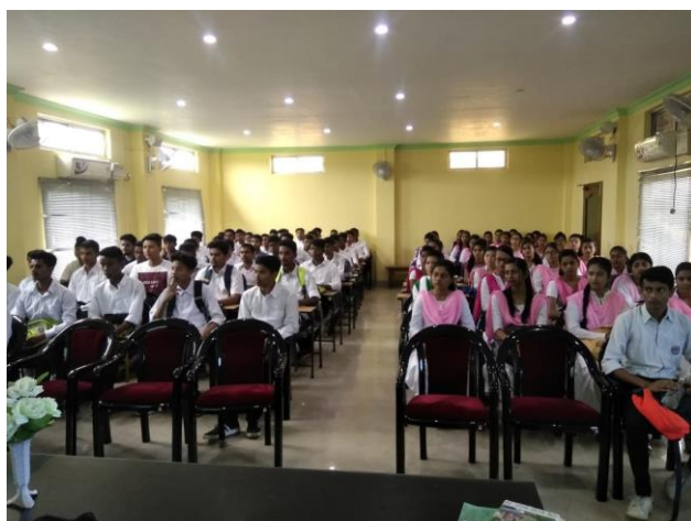
COLLEGE DIGITAL ROOM