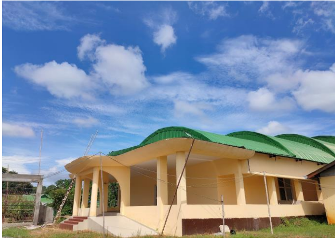
M C Chakrabarty Auditorium