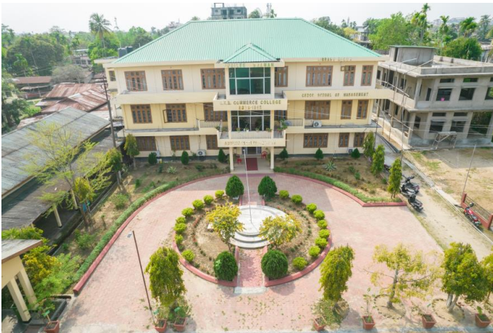
COLLEGE ADMINISTRATIVE BUILDING