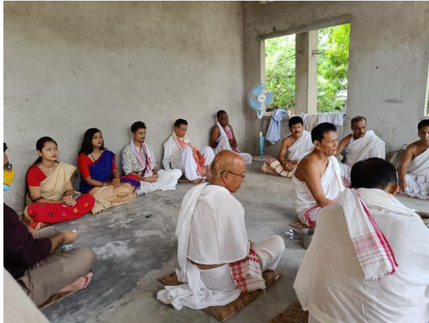
SANKARDEVA TITHI AT COLLEGE