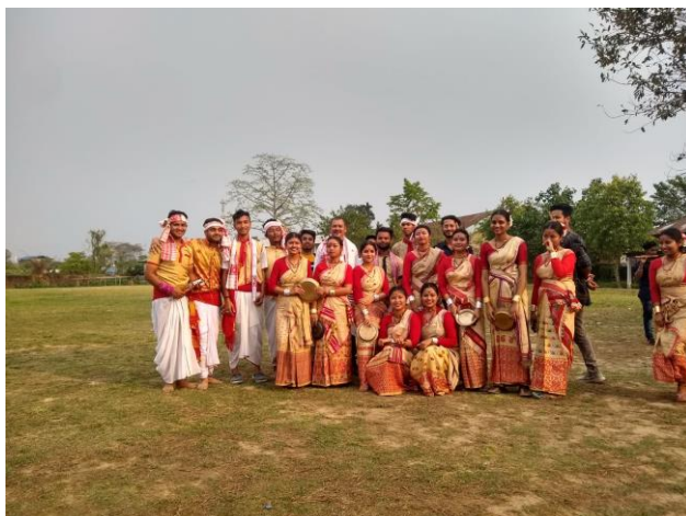
BIHU AT COLLEGE