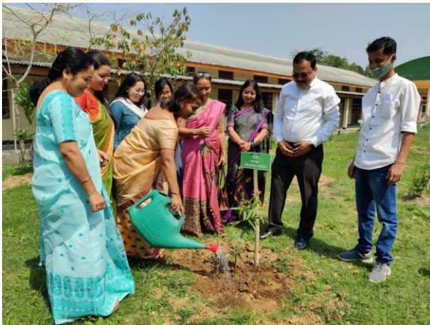
TREE PLANTATION AT COLLEGE