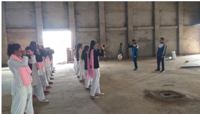
MUWATHAI TRAINING AT COLLEGE