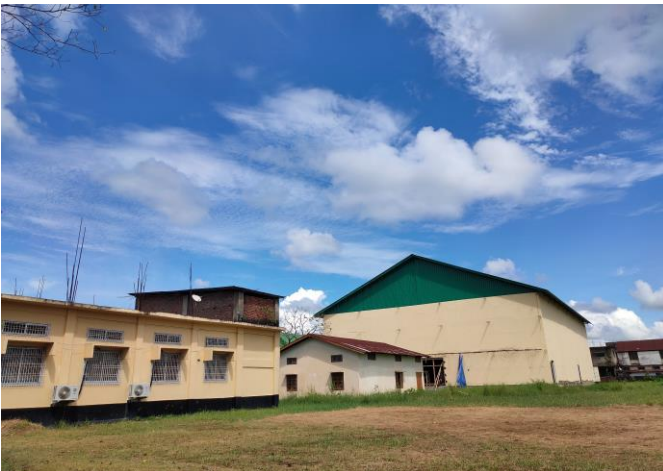
D N SARMA INDOOR STADIUM