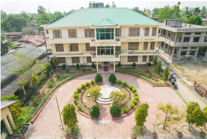
COLLEGE ADMINISTRATIVE BUILDING